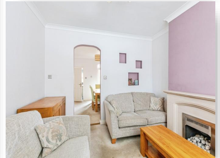
College Street, Wellingborough NN8 3HF