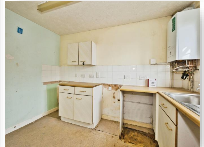
Raglan Terrace, Yeovil, BA21 3JX