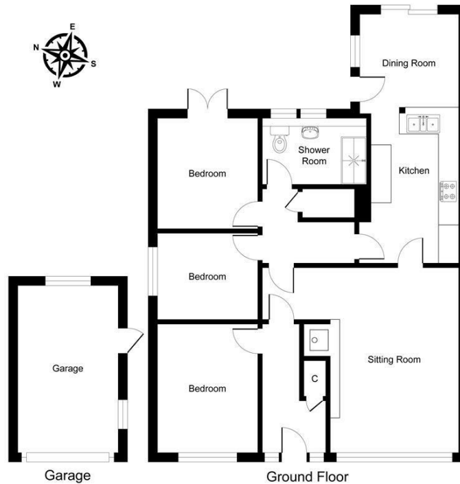
Illustration for identification purposes only, measurements approximate, not to scale. Copyright