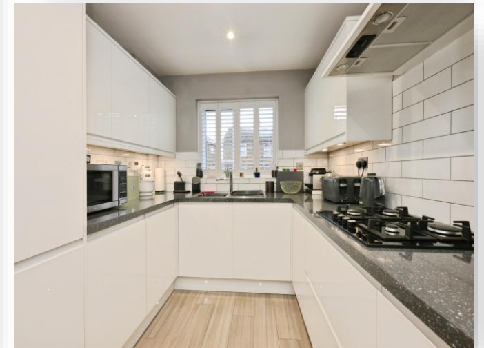
Bantel Villas, Hoddesdon EN11 0HA