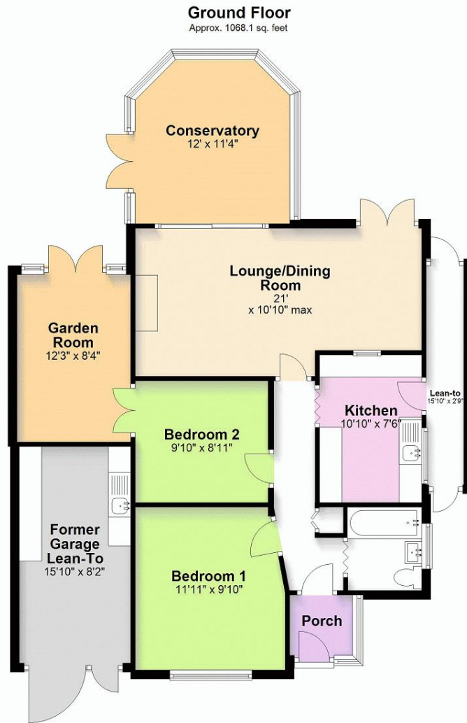
Ground Floor Approx. 1068.1 sq. feet