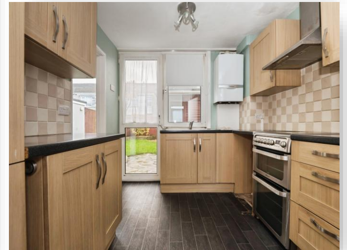
Landseer Road, Southampton SO19 1EF