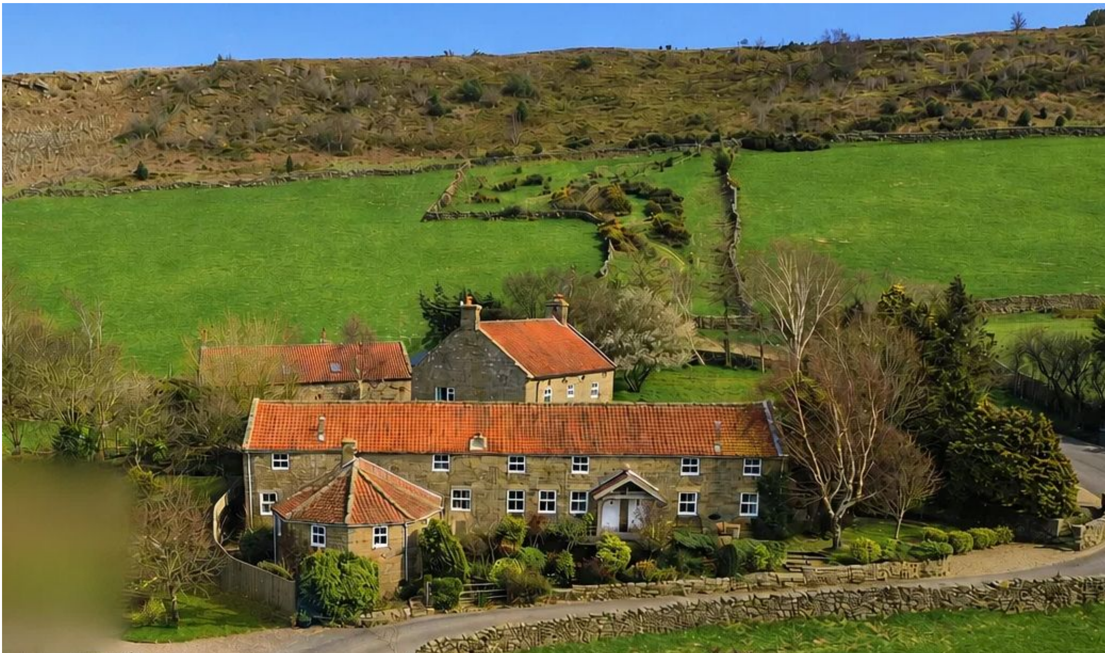
The Wheelhouse, Glaisdale Dale, Glaisdale Guide Price £695,000