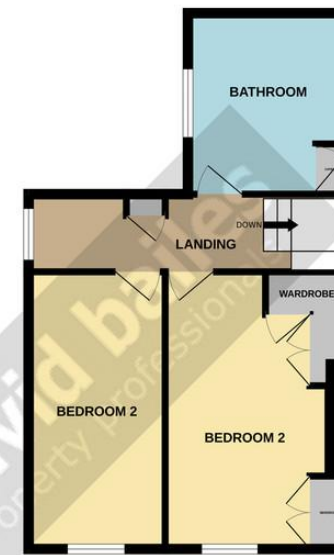
1ST FLOOR 41.2 sq.m. (444 sq.ft.) approx.