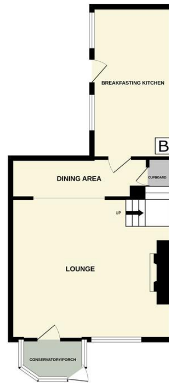
GROUND FLOOR 48.3 sq.m. (520 sq.ft.) approx.