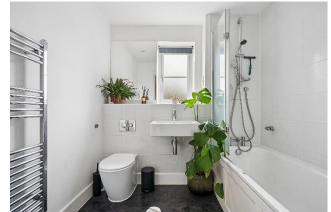
BATHROOM panel enclosed bath with shower attachment, wall hung wash basin, low level w.c., towel rail/radiator, double glazed frosted window, tiled splashbacks and tiled flooring, extractor fan.