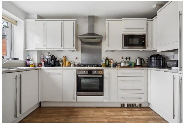
KITCHEN fitted with a single drainer sink unit set in laminated work surface with ample drawers and cupboards under, electric oven with four plate gas hob and cooker hood over, ample wall cupboards, one housing wall mounted gas fired central heating boiler, integrated fridge/freezer, dishwasher and washing machine.