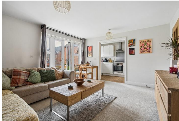
LIVING ROOM with double glazed window and doors to patio, radiator, tv point. Sliding doors to

ENTRANCE HALL radiator, storage and cloaks cupboard.