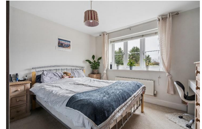
BEDROOM with double glazed window, built in mirror fronted wardrobes, radiator.