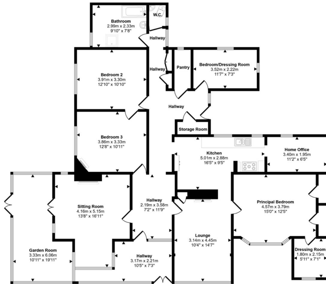
Floorplan Approx 177 sq m / 1907 sq ft

This floorplan is only for illustrative purposes and is not to scale. Measurements of rooms, doors, windows, and any items are approximate and no responsibility is taken for any error, omission or mis-statement. Icons of items such as bathroom suites are representations only and may not look like the real items. Made with Made Snappy 360.