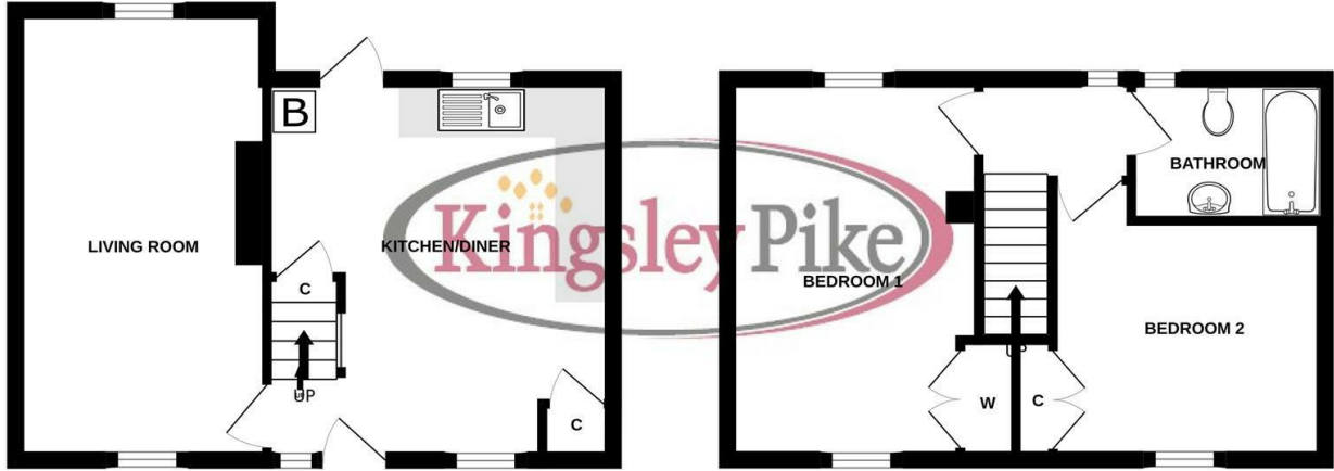
2 BEDROOM TERRACE HOUSE

Whilst every attempt has been made to ensure the accuracy of the floorplan contained here, measurements of doors, windows, rooms and any other items are approximate and no responsibility is taken for any error, omission or mis-statement. This plan is for illustrative purposes only and should be used as such by any prospective purchaser. The services, systems and appliances shown have not been tested and no guarantee as to their operability or efficiency can be given. Made with Metropix ©2025