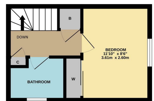
TOTAL FLOOR AREA: 441 sq.ft. (40.9 sq.m.) approx.

Whilst every attempt has been made to ensure the accuracy of the floorplan contained here, measurements of doors, windows, rooms and any other items are approximate and no responsibility is taken for any error, omission or mis-statement. This plan is for illustrative purposes only and should be used as such by any prospective purchaser. The services, systems and appliances shown have not been tested and no guarantee as to their operability or efficiency can be given. Made with Metropix ©2026