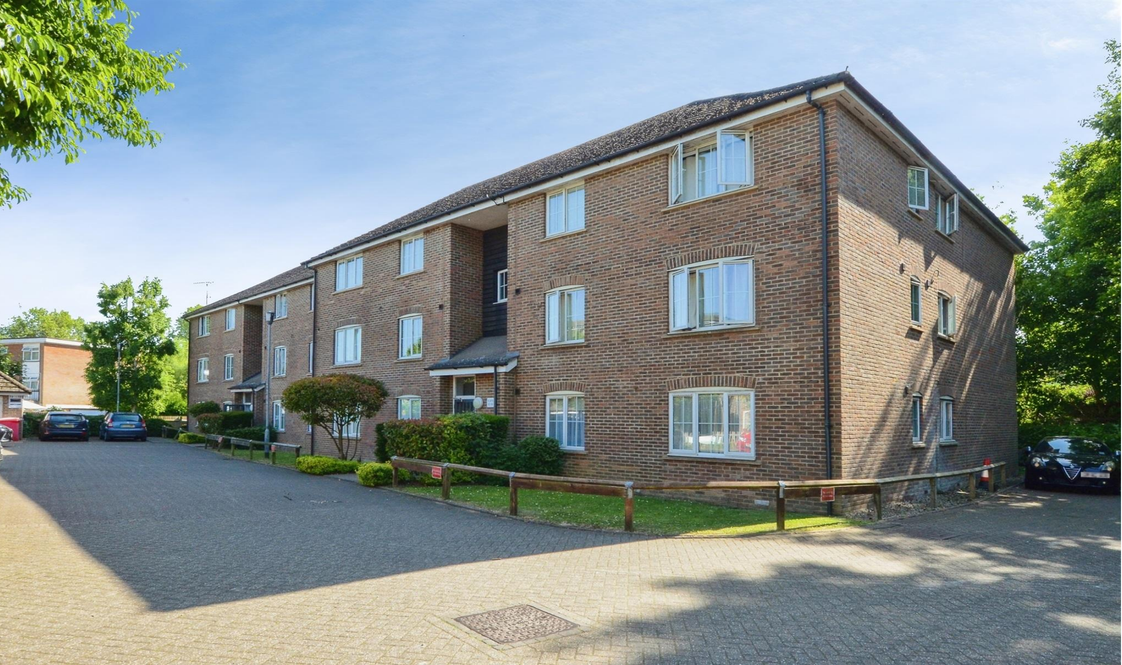
Lordsmill Court, Waterside, Chesham HP5 1PR