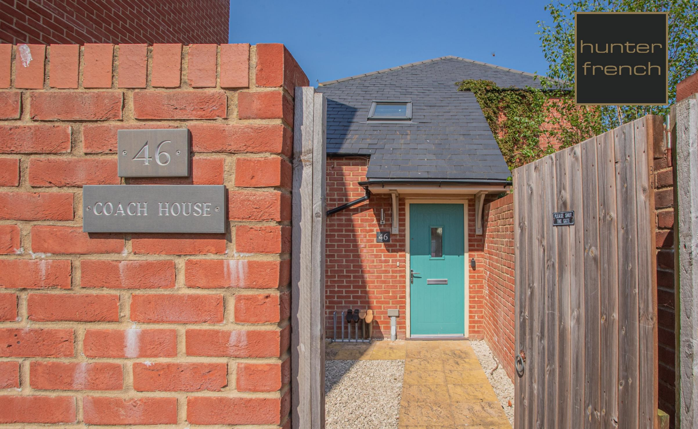
46 Brays Avenue, Tetbury, Gloucestershire, GL8 8TL