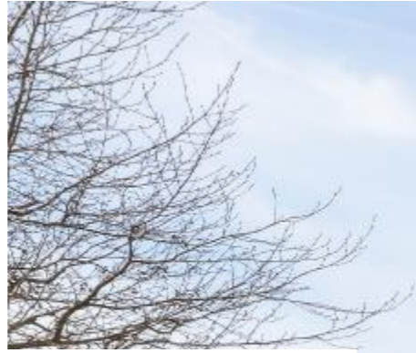
Below: Side Garden