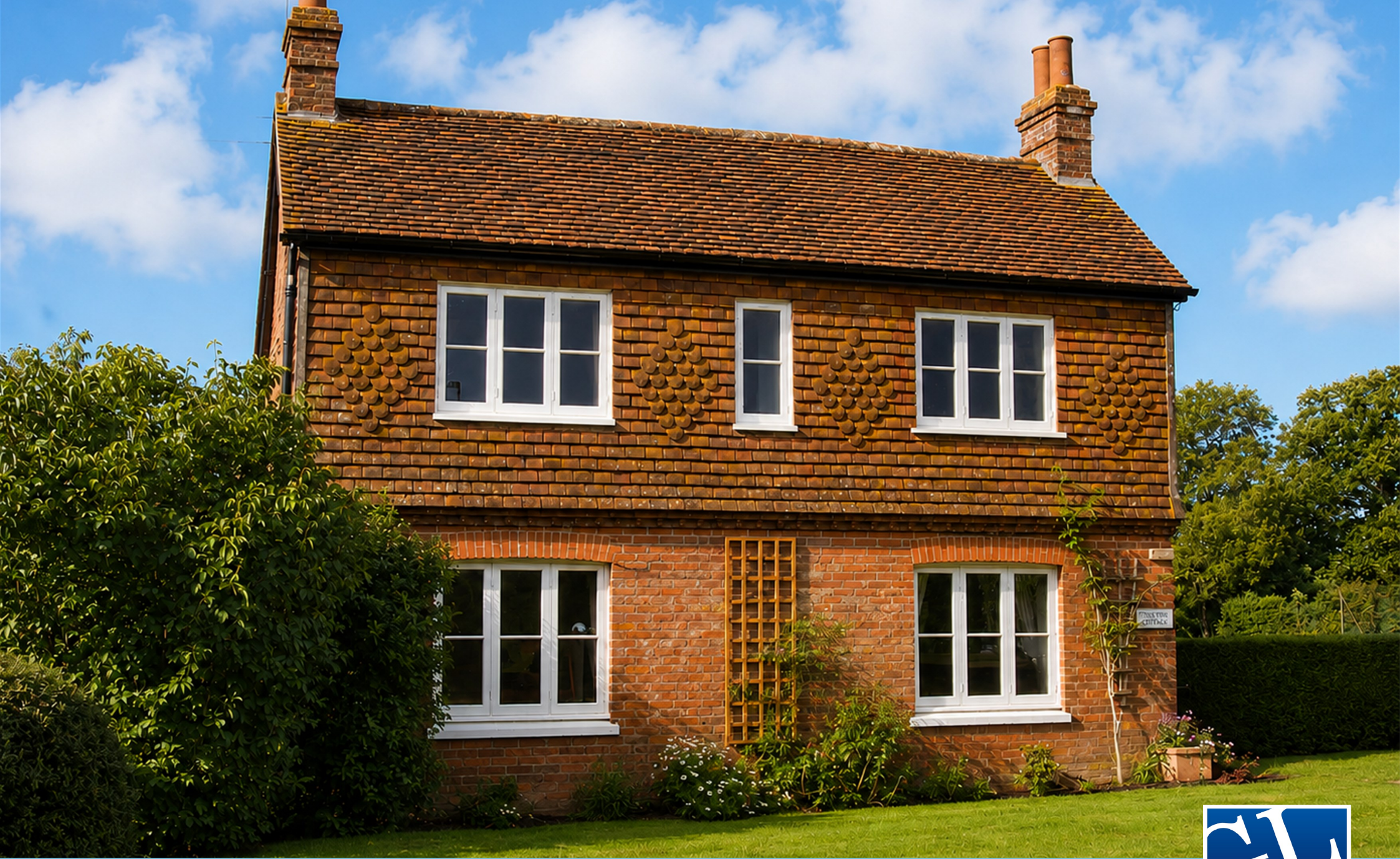
Kitty's Cottage, Bignor Park, Bignor, West Sussex RH20 1HG