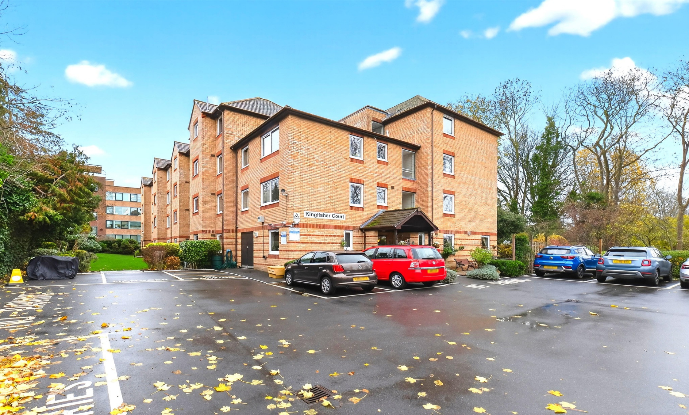
Kingfisher Court, Ewell Road, Surbiton, KT6 6AZ