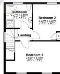
First Floor Approx. 34.5 sq. metres (371.3 sq. feet)