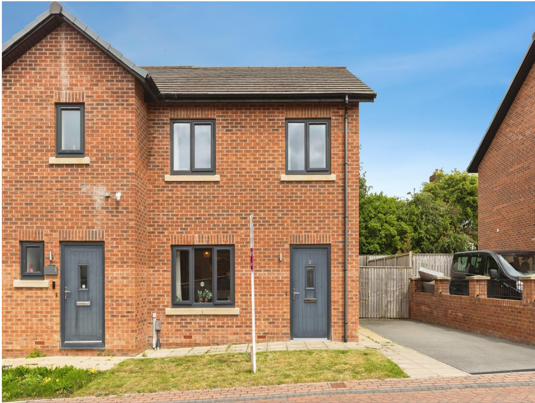
Stan Cohen Way, LEEDS LS15 0FD