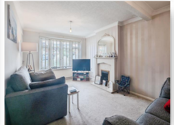
Cookson Place, Loughborough