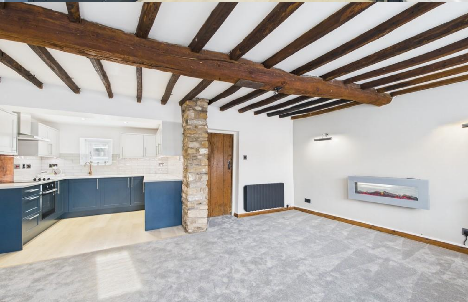
Open Plan Living