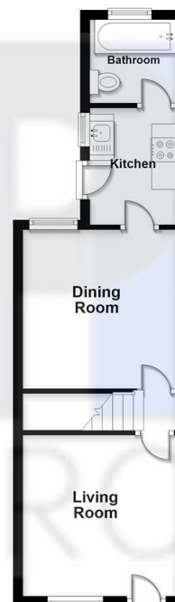
Ground Floor Approx. 31.8 sq. metres (341.9 sq. feet)