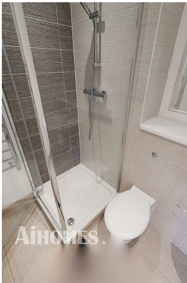
Modern 2B2B Apartment | Advent House | M4 |82125TP