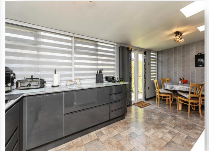
Knoll Park, East Ardsley Wakefield WF3 2AX