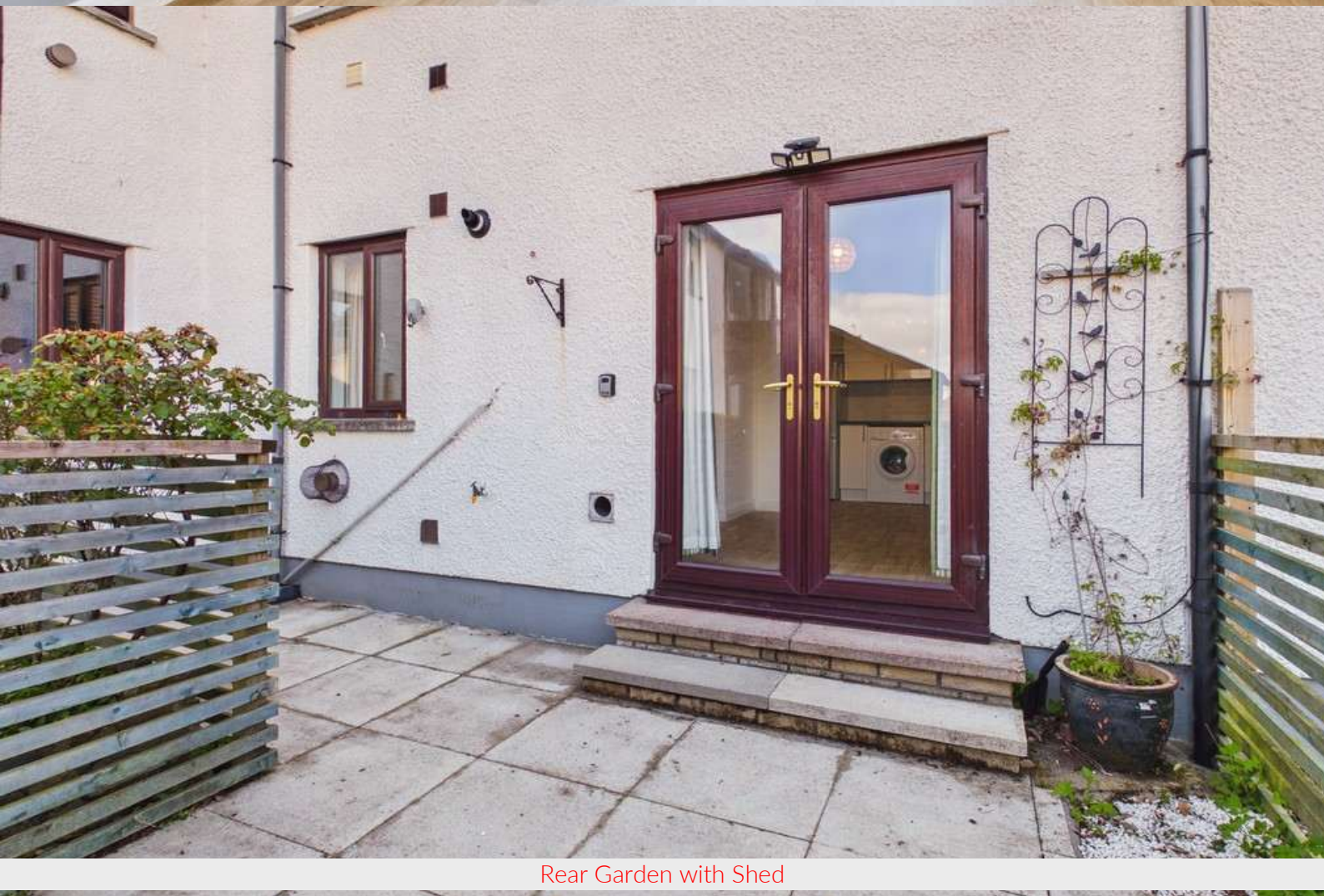
Rear Garden with Shed