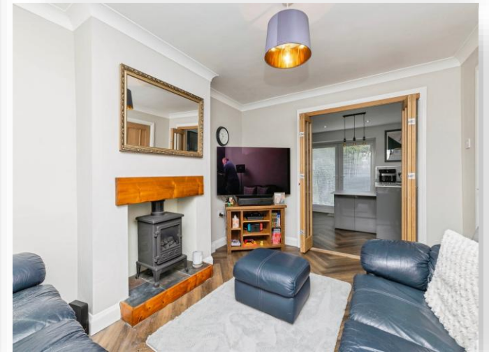
Grosmont Road, HARTLEPOOL, TS25 1ED