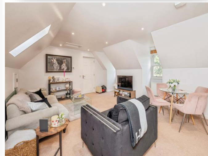
Frazers Yard, Aylsham, Norwich, NR11 6FB