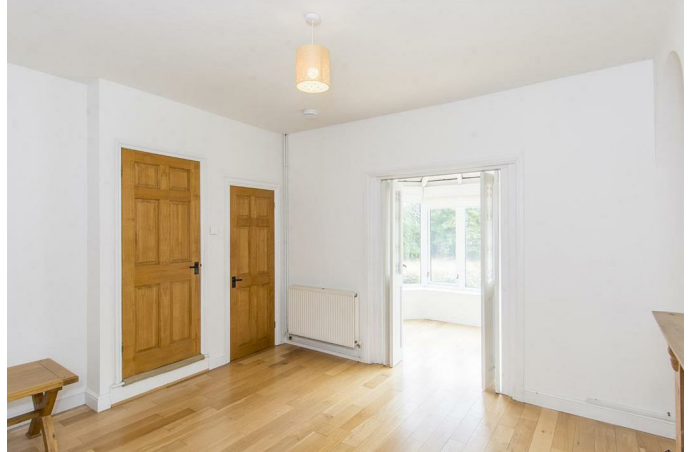
Conservatory 10'4" x 6'3" (3.15m x 1.91m)