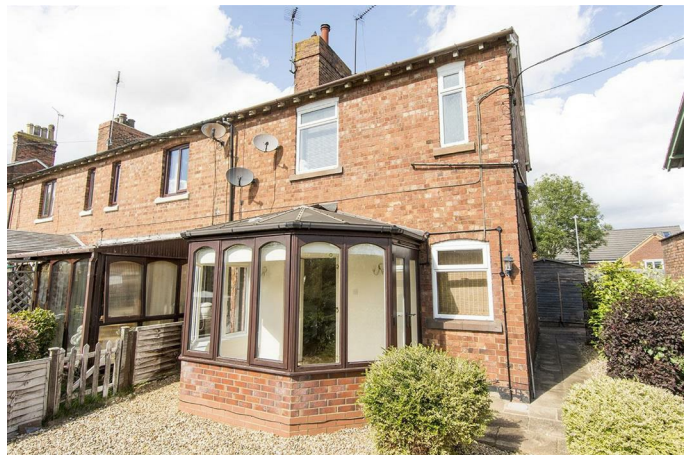
(Pocket Park Photo)