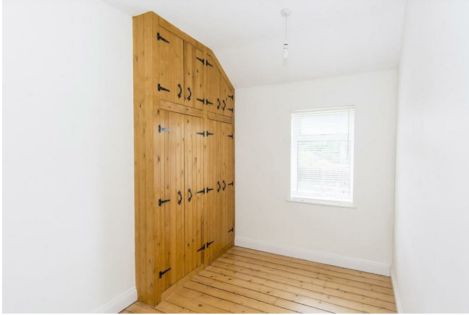
Bedroom Two 13'0" x 9'2" (3.96m x 2.79m)

UPVC double-glazed window to front. Built in wardrobe and cupboards. Radiator.