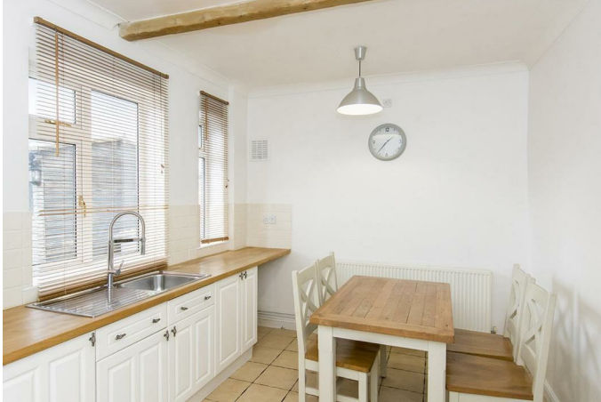
Kitchen/Diner 17'6" x 9'6" (5.33m x 2.90m)

Two UPVC double-glazed windows to front. Fitted range of wall and floor mounted units. Worktops over with stainless steel sink inset. Electric oven. Induction hob with extractor hood over. Space and plumbing for washing machine. Space for fridge/freezer. Tiled splash backs. Tiled flooring. Radiator.