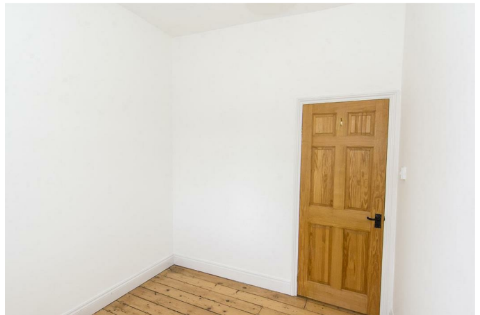
(Bedroom Three Photo Two)

UPVC double-glazed window to front. Exposed floor boards. Radiator.