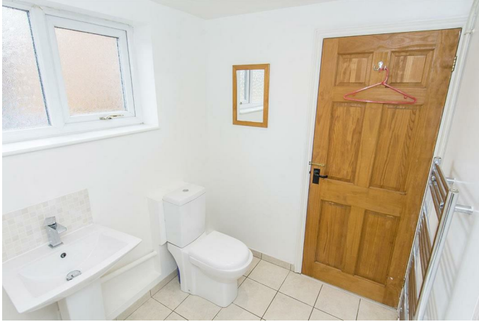
(Ground Floor Bathroom Photo Two)