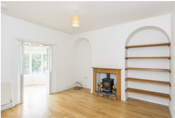
Lounge 14'2" x 12'2" (4.32m x 3.71m)

Shelving to alcoves. Radiator. Oak engineered floor boards. Storage cupboard off with additional UPVC double-glazed window and shelving.