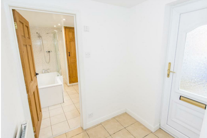
Entrance Hall 6'5" x 5'2" (1.96m x 1.57m)

Opaque UPVC double-glazed front entrance door. Tiled floor. Radiator.