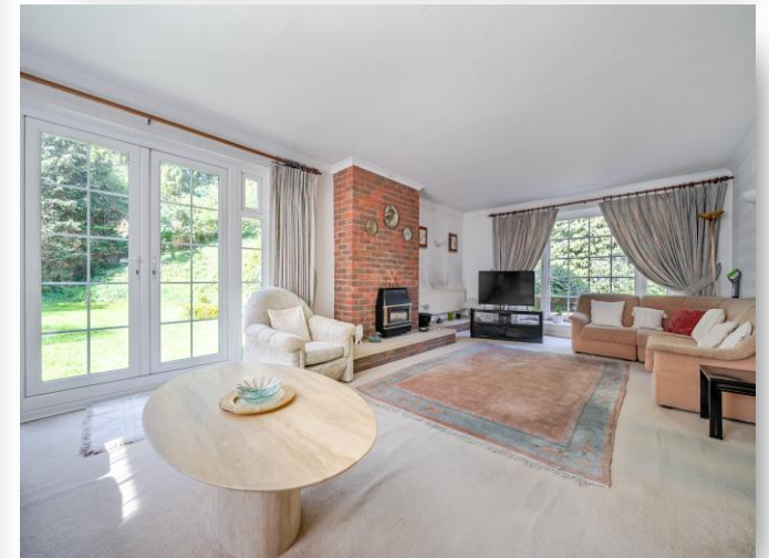
7 Bramble Drive, Maidenhead SL6 3NX