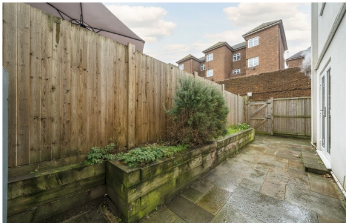
Trafalgar Grove, SE10