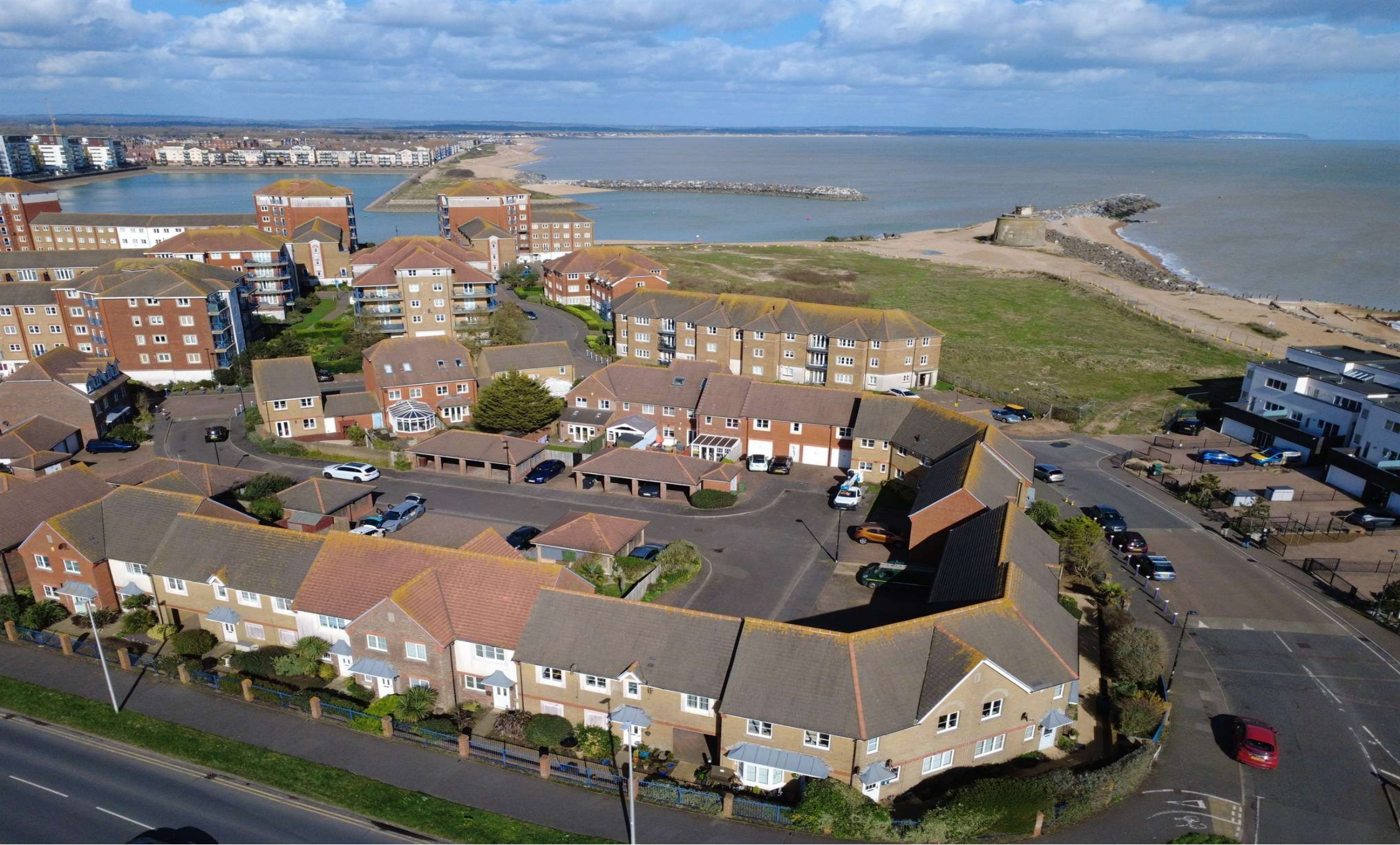
Grenada Close, Eastbourne BN23 5TJ