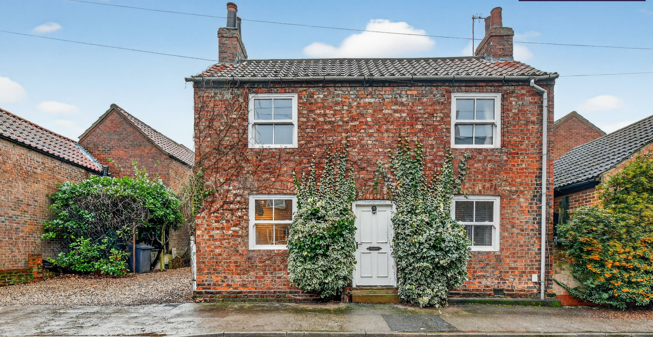
Fishermans Cottage Front Street Naburn