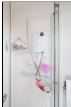
En-Suite to Bedroom One