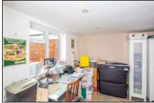
Bedroom Four/Craft Room