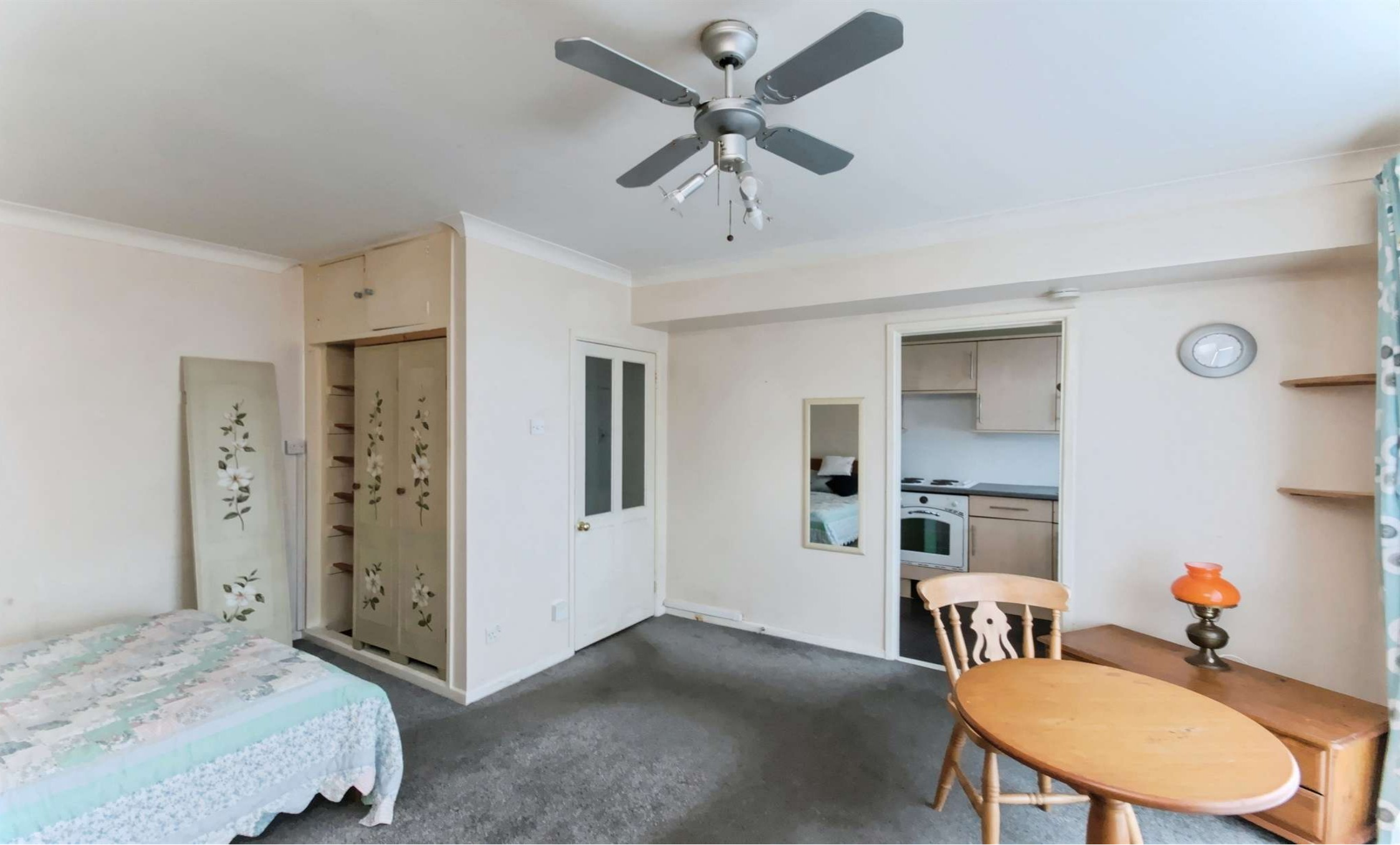
Manton Court Rotunda Road, Eastbourne BN23 6LG