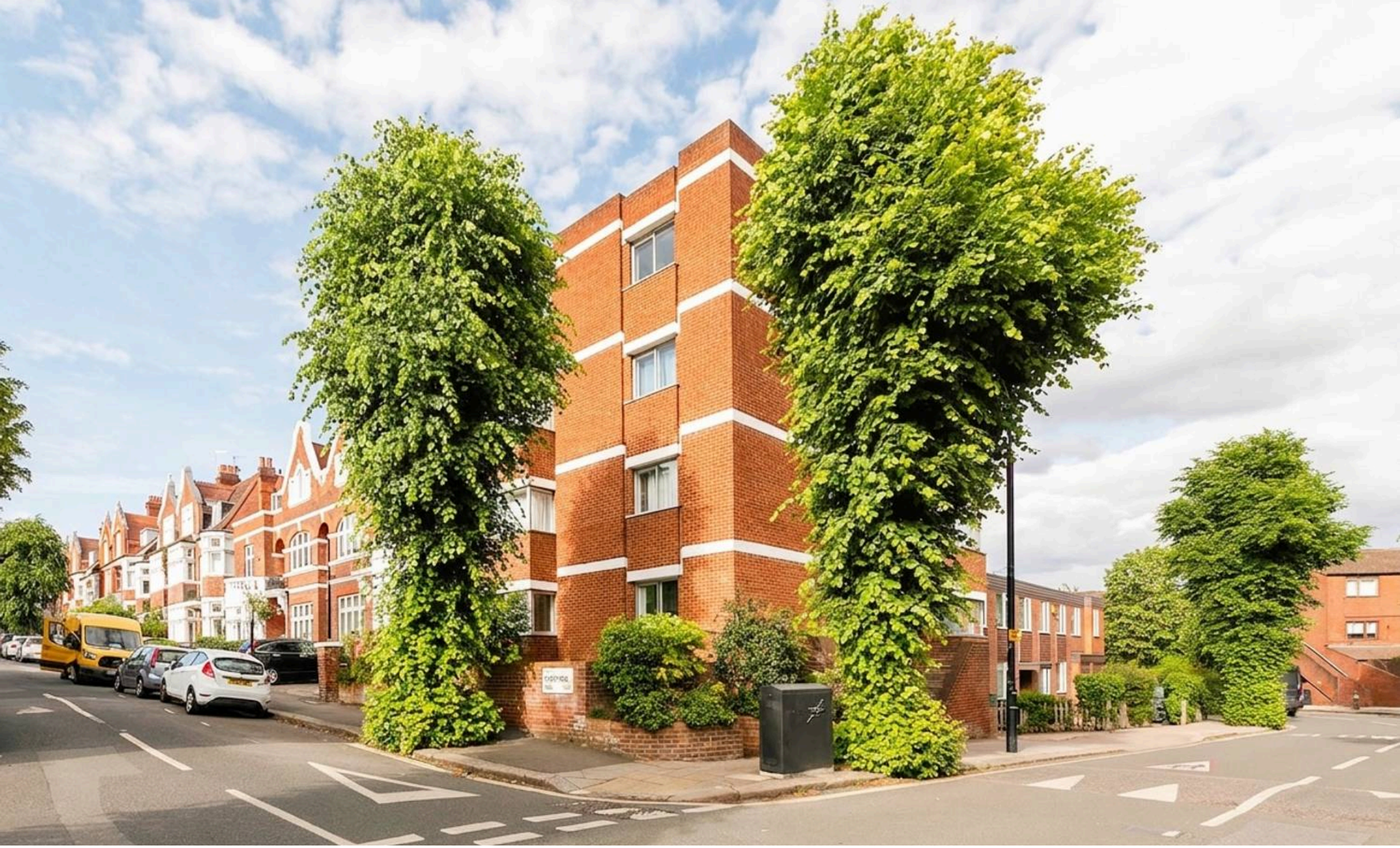
Lymington Road, West Hampstead, NW6 £1,800 pcm