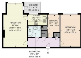
BEECH HAVEN COURT LONDON ROAD CRAYFORD DARTFORD DA1

These particulars form no part of any contract and are issued as a general guide only. Main services and appliances have not been tested by the agents and no warranty is given by them as to working order or condition. All measurements are approximate and have been taken at the widest points unless otherwise stated. The accuracy of any floor plans published cannot be confirmed. Reference to tenure, building works, conversions, extensions, planning permission, building consents/regulations, service charges, ground rent, leases, fixtures, fittings and any statement contained in these particulars should not be relied upon and must be verified by a legal representative or solicitor before any contract is entered into.