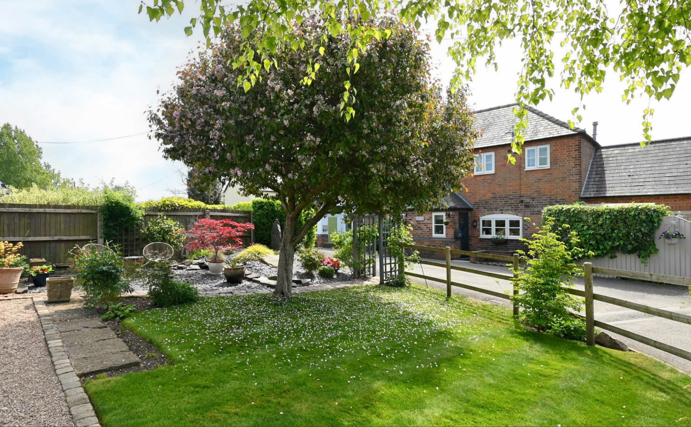
Springfield Cottage, Wilmore Lane, Rangemore, DE13 9RD