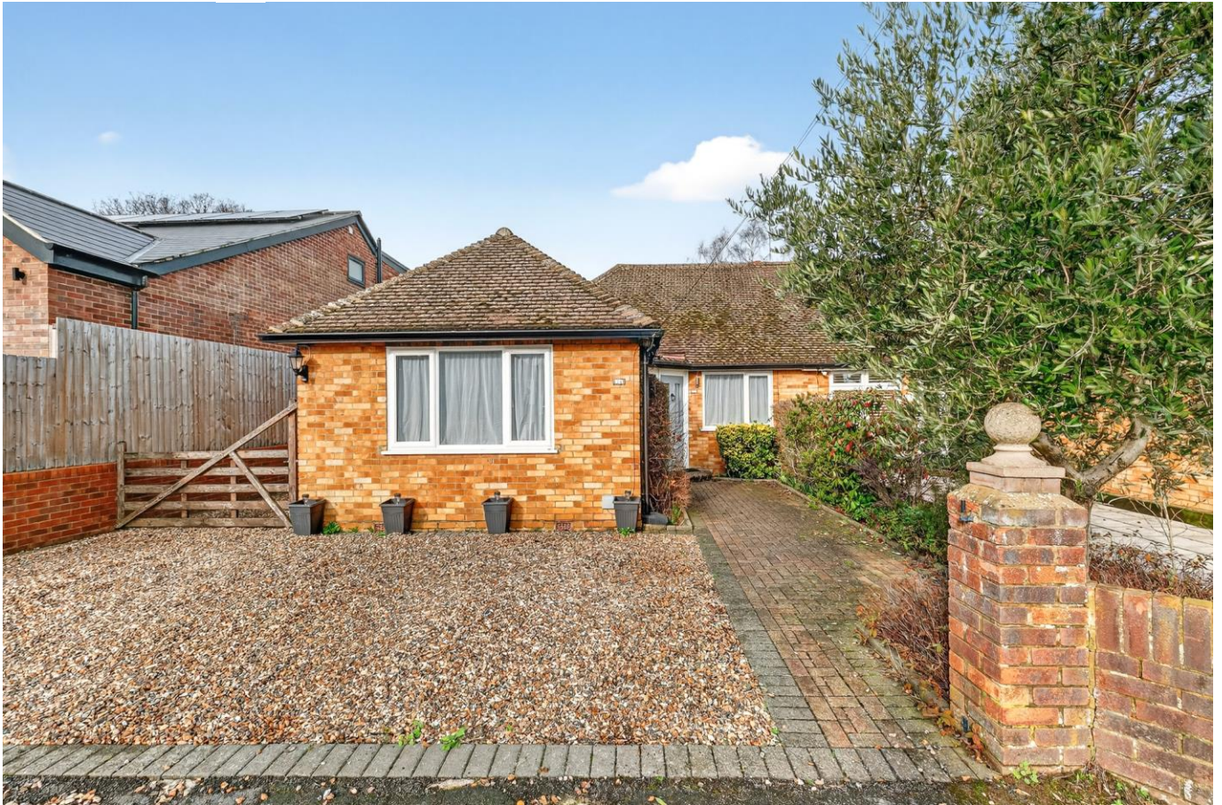
24 Katherine Close Row Town Surrey KT15 1NX