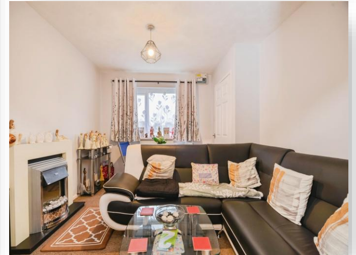
Richard Hind Walk, Stockton-On-Tees TS18 3LU