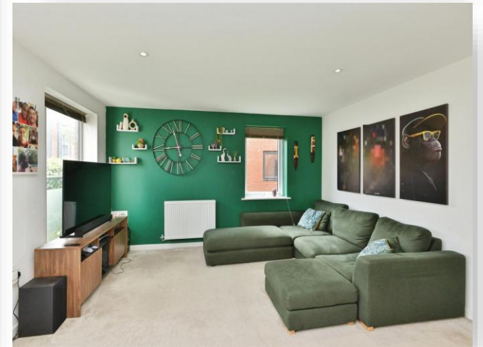
Flat 1 Cicero Crescent, Fairfields Milton Keynes MK11 4BR