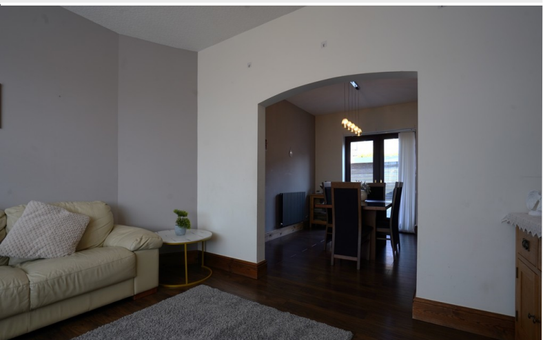
Living Room Into Dining Room