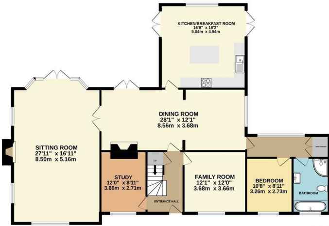
GROUND FLOOR 1626 sq.ft. (151.1 sq.m.) approx.