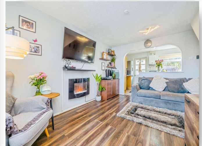
Verbena Close, St. Mellons Cardiff CF3 0NE