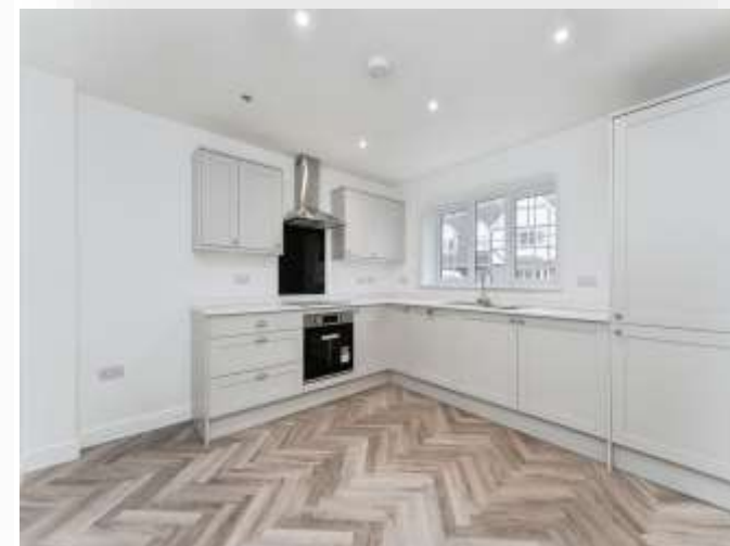
1 Spring View, Westfield Road, Manea PE15 0LS