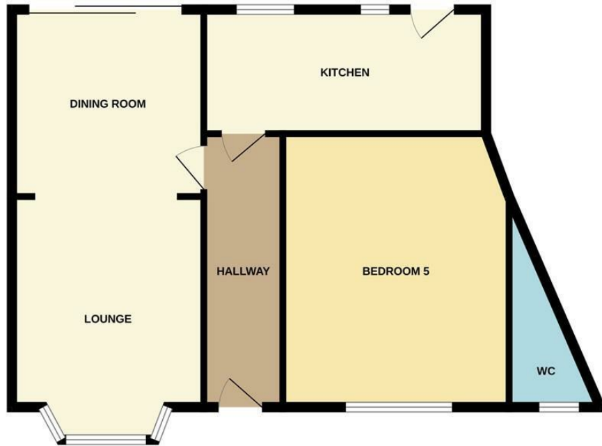
GROUND FLOOR 685 sq.ft. (63.7 sq.m.) approx.