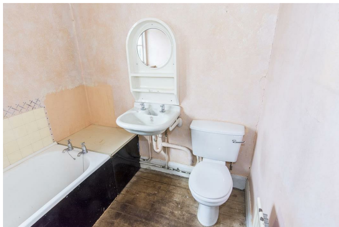
Bathroom 7'3"x 6'6" (2.21m x 1.98m)

Single-glazed window to front. WC. Pre-1900 Doulton wash hand basin. Radiator.