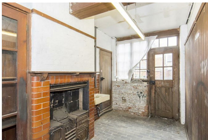
Tack Room 14'9" x 8'0" (4.50m x 2.44m)

Original stove fire. Built-in cupboards. Timber panelling to walls.