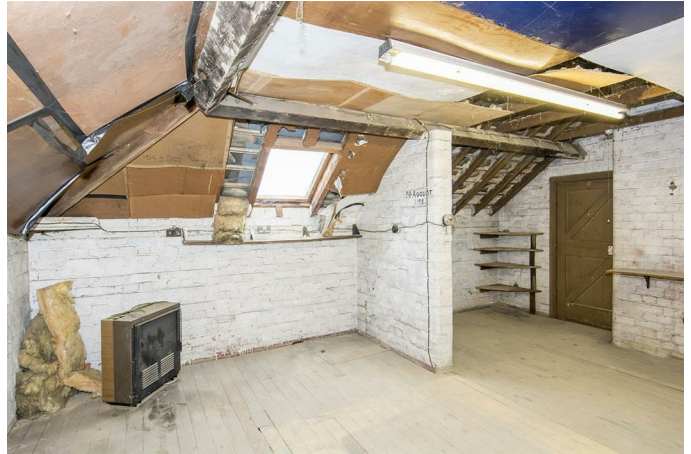
Hay Loft Room One 15'3" x 10'4" (4.65m x 3.15m)

Double-glazed Velux skylight to rear. Window to front.