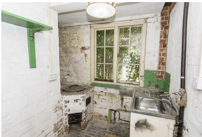
Utility 9'8" x 6'0" (2.95m x 1.83m)

Original fossil fuelled water heater. Stainless steel sink. Space and plumbing for washing machine.