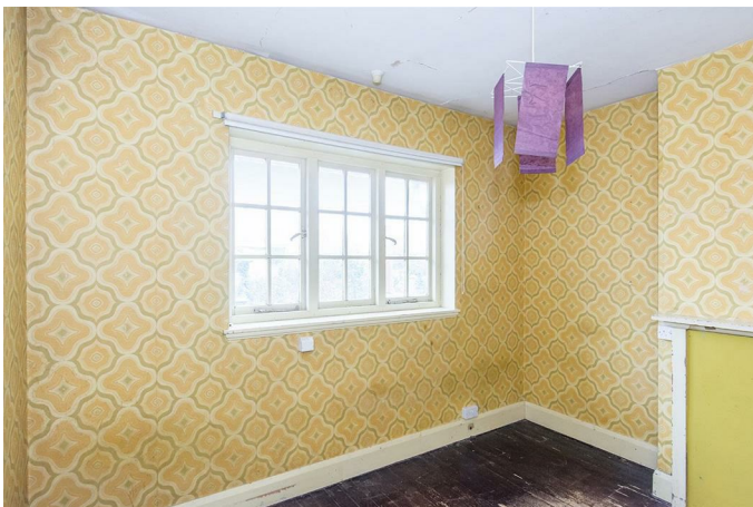
Bedroom Two 11'9" x 9'5" (3.58m x 2.87m)