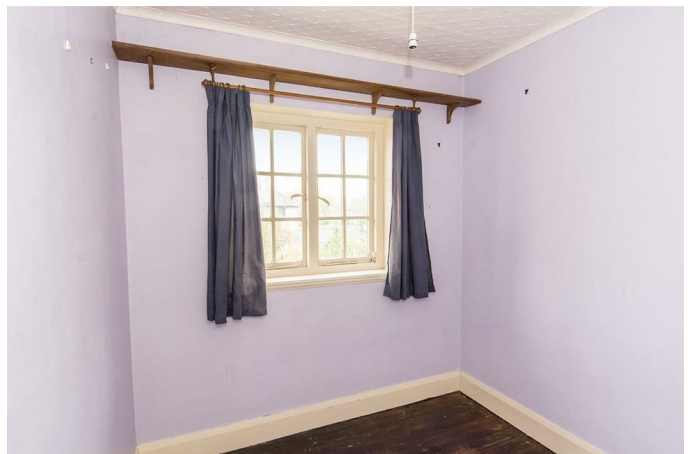
Bedroom Four 9'2" x 8'3" (2.79m x 2.51m)