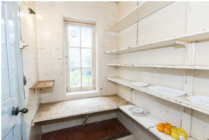
Pantry 9'4" x 4'7" (2.84m x 1.40m)

Single-glazed window to rear. Cold slab, and wraparound shelving.