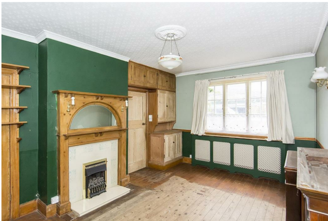
Dining Room 16'5" x 11'8" (5.00m x 3.56m)

Window to front. Gas fire. Range of built in cupboards. Radiator.