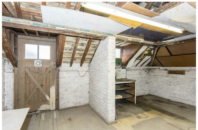
Hay Loft Room Two 15'3" x 7'4" (4.65m x 2.24m)

Double-glazed Velux skylight to rear. Window to front.