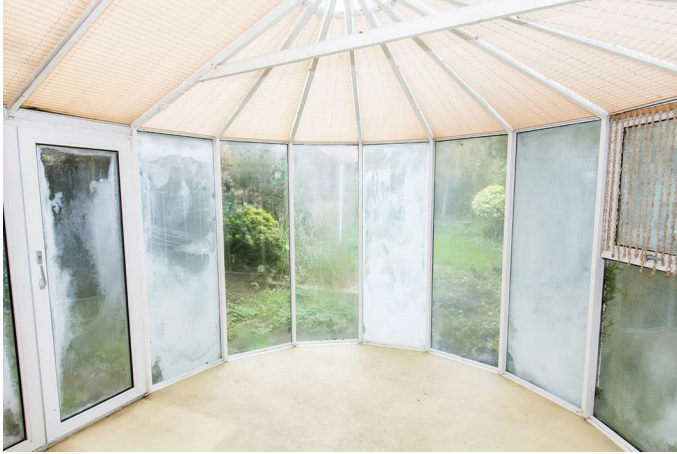
Conservatory 11'3" x 10'4" (3.43m x 3.15m)