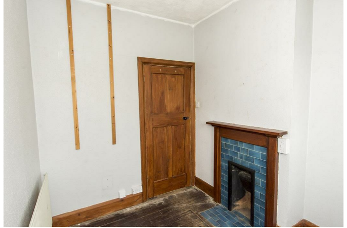
Bedroom Three 9'3" x 8'3" (2.82m x 2.51m)

Shower cubicle. Wash hand basin over storage unit. Radiator.