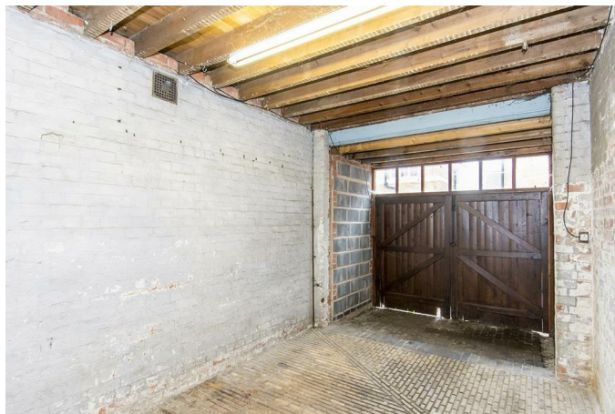
Stable/Garage 21'2" x 10'4" max (6.45m x 3.15m max)

Double timber vehicle access doors. Original equestrian flooring.