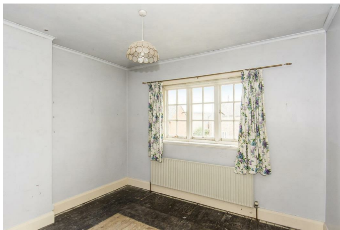
Bedroom One 11'9" x 10'2" (3.58m x 3.10m)

Single-glazed window to front. Radiator.