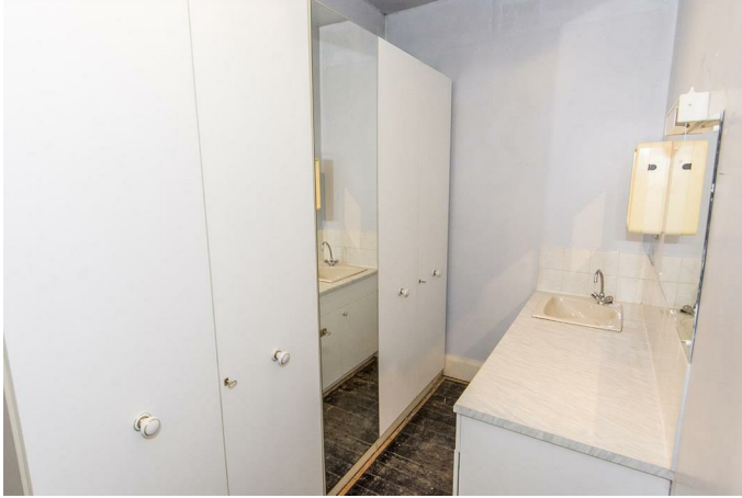
En-Suite Shower Room 12'0" x 5'8" (3.66m x 1.73m)

Shower cubicle. Wash hand basin over storage unit. Radiator.