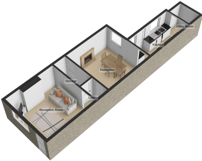
Ground Floor 454 sq.ft. (42.2 sq.m.) approx.