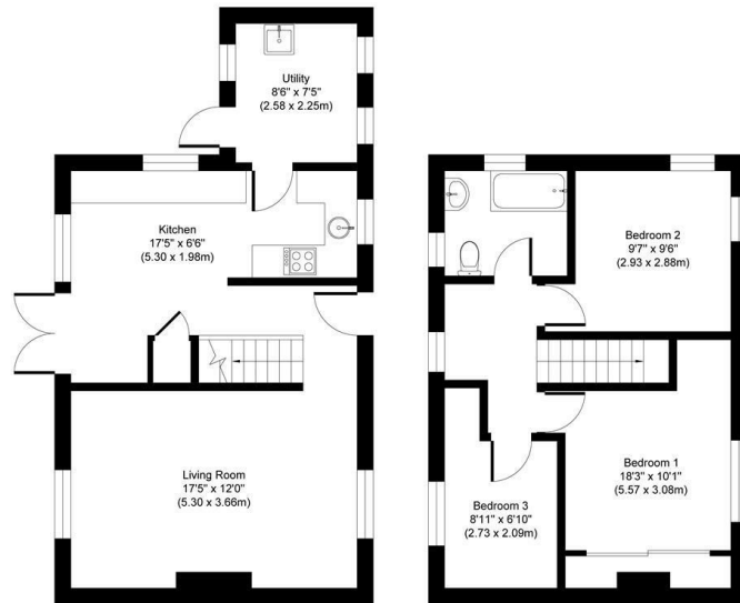
Ground Floor Approximate Floor Area 508 sq.ft (47.20 sq.m)

Wallsend is a vibrant and historically rich town that offers an excellent blend of urban convenience and community charm. Known for its Roman heritage, most notably as the eastern terminus of Hadrian's Wall. Wallsend combines fascinating history with modern day amenities, making it a desirable location for families, professionals, and investors alike. The town boasts a range of local shops, supermarkets, cafes, and restaurants, alongside excellent leisure facilities and green spaces such as Richardson Dees Park and the scenic Wagonways. Wallsend's regenerated town centre and Forum Shopping Centre provide convenient access to everyday essentials. For families, the area is well-served by a selection of primary and secondary schools, while strong transport links make commuting easy.