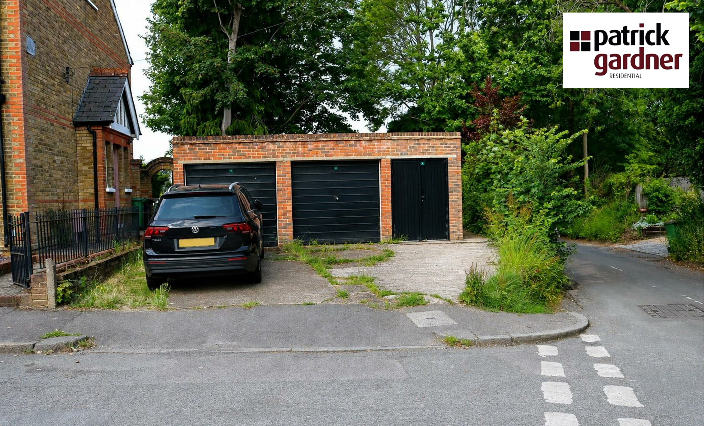
Garages at Gladstone Road, Ashted, KT21 2NS