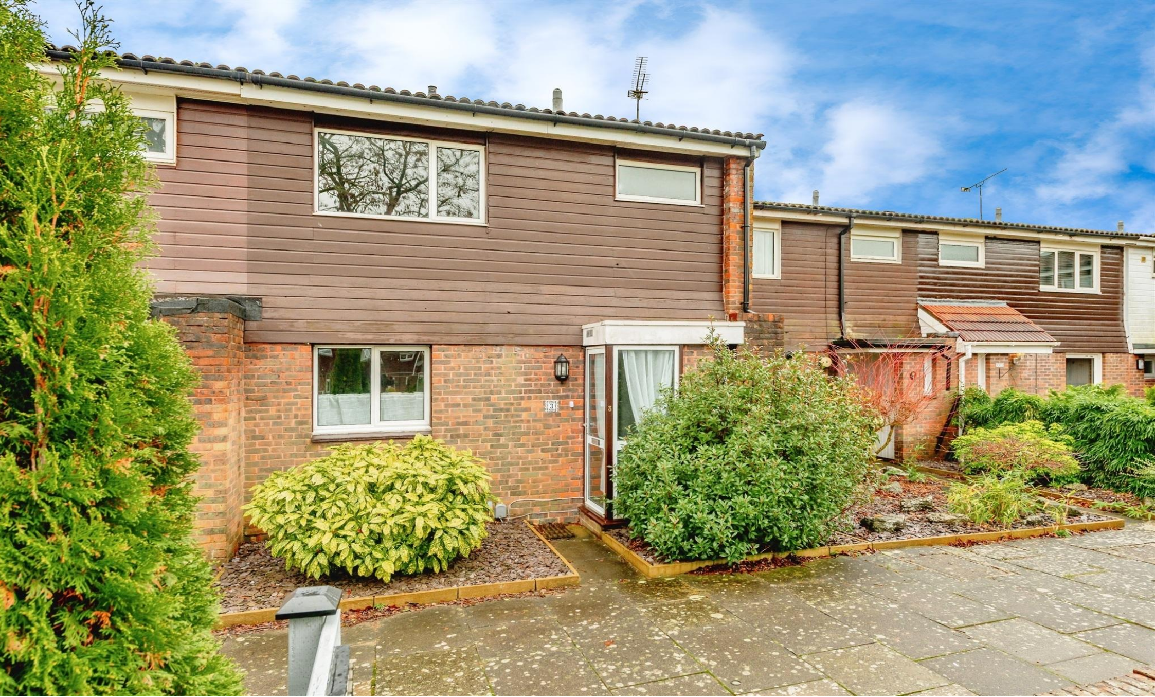
Beale Court Scory Close, Crawley RH11 8NU